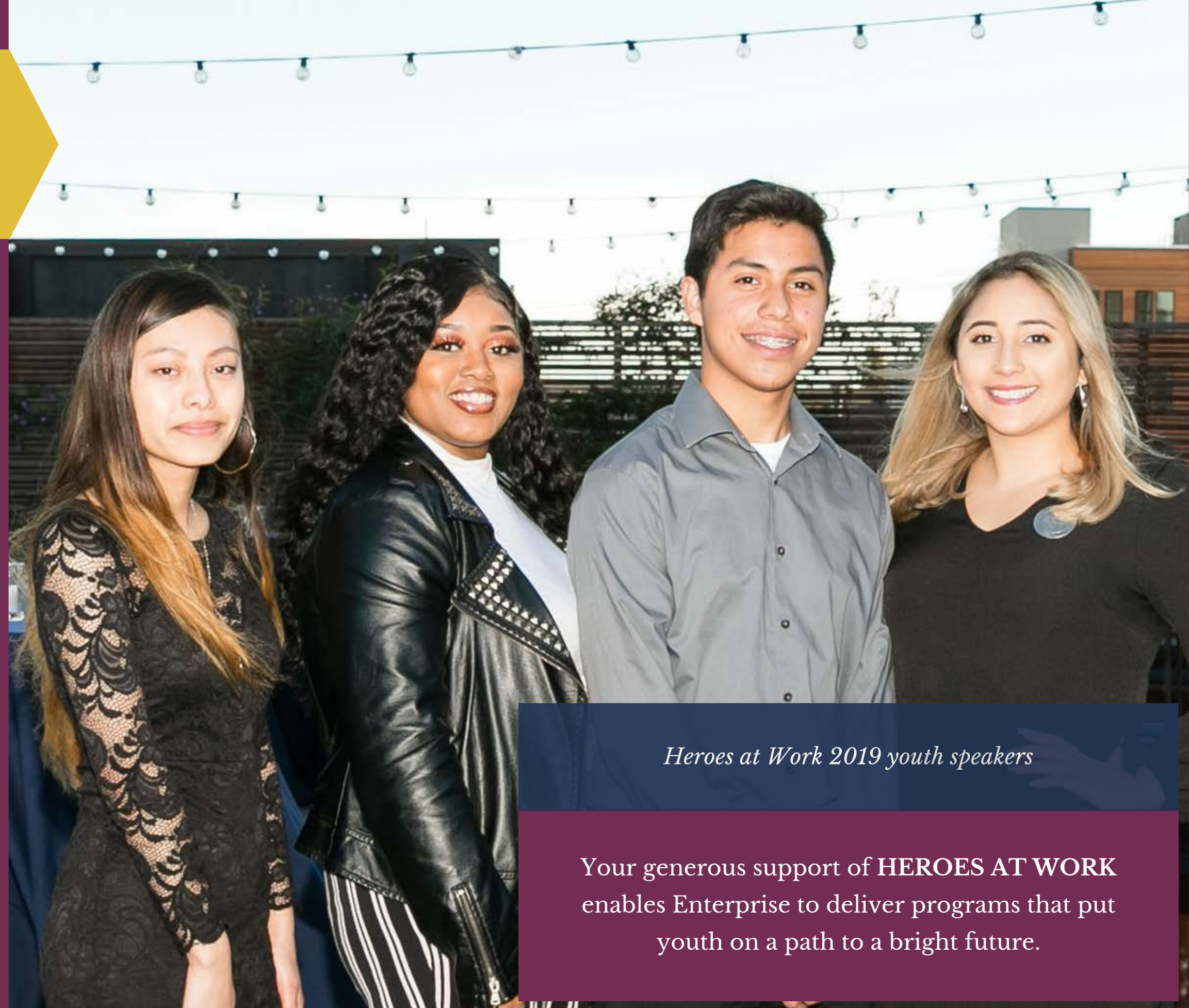
Heroes at Work 2019 youth speakers

Hosts and their guests are invited to a VIP experience before the event to meet a vibrant and talented young person from Enterprise for Youth. Meeting a young person gives them a valuable opportunity to practice their communication and networking skills and provides you, their supporters, the chance to hear directly how Enterprise has helped them.